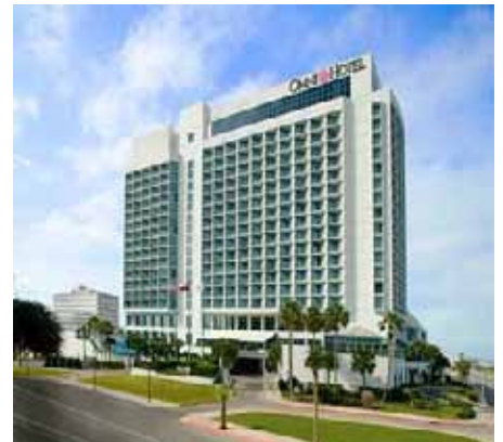
The 35th Annual CLEAT Convention will be held at the Omni Bayfront in Corpus Christi. See Page 12 for more information or www.CLEAT.org/Convention2011/ for all the details.