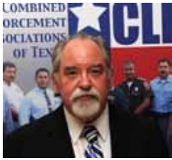
By Charley Wilkison CLEAT Public Affairs

Politicians are always against crime and criminals and for protecting the citizens. Just ask one of them. Regardless of party affiliation or whether they were sworn in at a courthouse, city hall, state Capitol or in Washington D.C. they all purport to be on your side in the battle against drug dealers, child rapists and murderers.